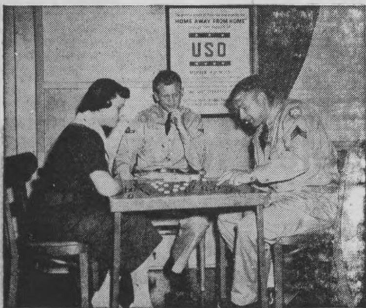
These young soldiers, shown in a southern USO club, are typical of thousands of GIs who enjoy the relaxation, recreation and friendly atmosphere offered them by USO clubs and lounges. USO is financed by United Defense Fund which seeks support through Community Chest and United Fund campaigns which are held throughout the country each year.