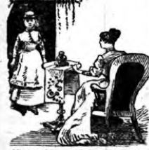
A Bright Servant

Then the little man looked scornfully upon the manager, gazed up his close and asked him to get out of the saloon. The manager, who was a little stout, and his eyes were a deep blue. He was wearing a dark suit and a white shirt with a dark tie. He was looking at the people who came in with a steady gaze. He was a little elderly man with a kind air, and a white hair, was seated at the doorway of a well-known saloon on Broadway yesterday afternoon. He was wearing a pair of gray side whiskers that partially covered his cheeks. He seemed to be in the habit of looking over his shoulder at the people who came in. He was a little stout, and his eyes were a deep blue. He was wearing a dark suit and a white shirt with a dark tie. He was looking at the people who came in with a steady gaze.