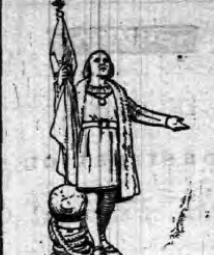
STATUE OF COLUMBUS.

Where? Chicago was the first to bid, but St. Louis was the first to be chosen. Washington is claiming over the matter, and New York says that no one can plan to hold it any day. But the fair is held, Columbus will have a permanent place in the world's history.