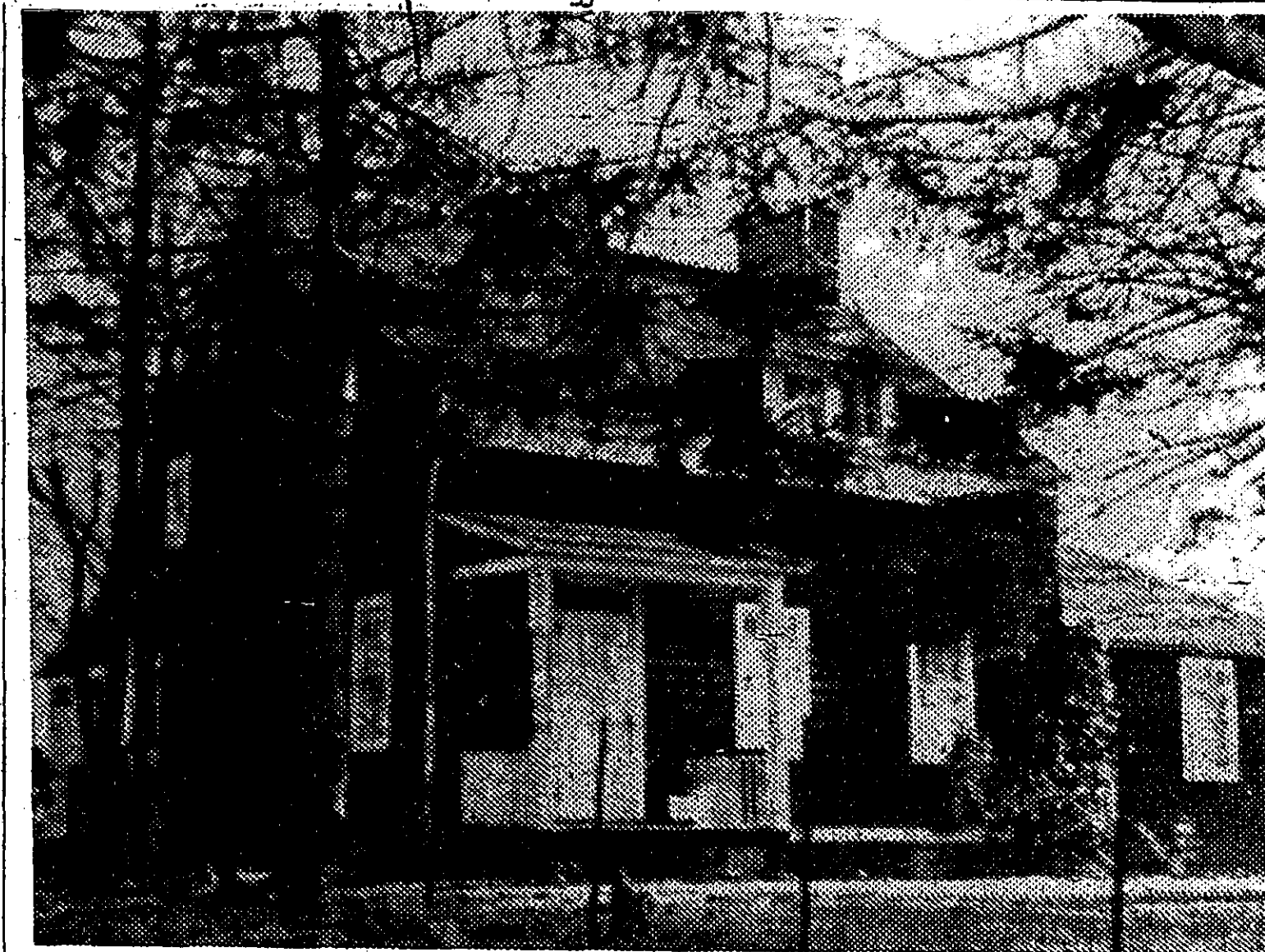
PLENTY OF HEAT - Situated at 823 Old Raritan Rd., Clark, this home features three fireplaces, and is similar in construction to the Westfield historic landmark, the Miller-Cory house. The home was built during the early

Organizers of the petition drive are expected to continue their fight to have the ordinance repealed.