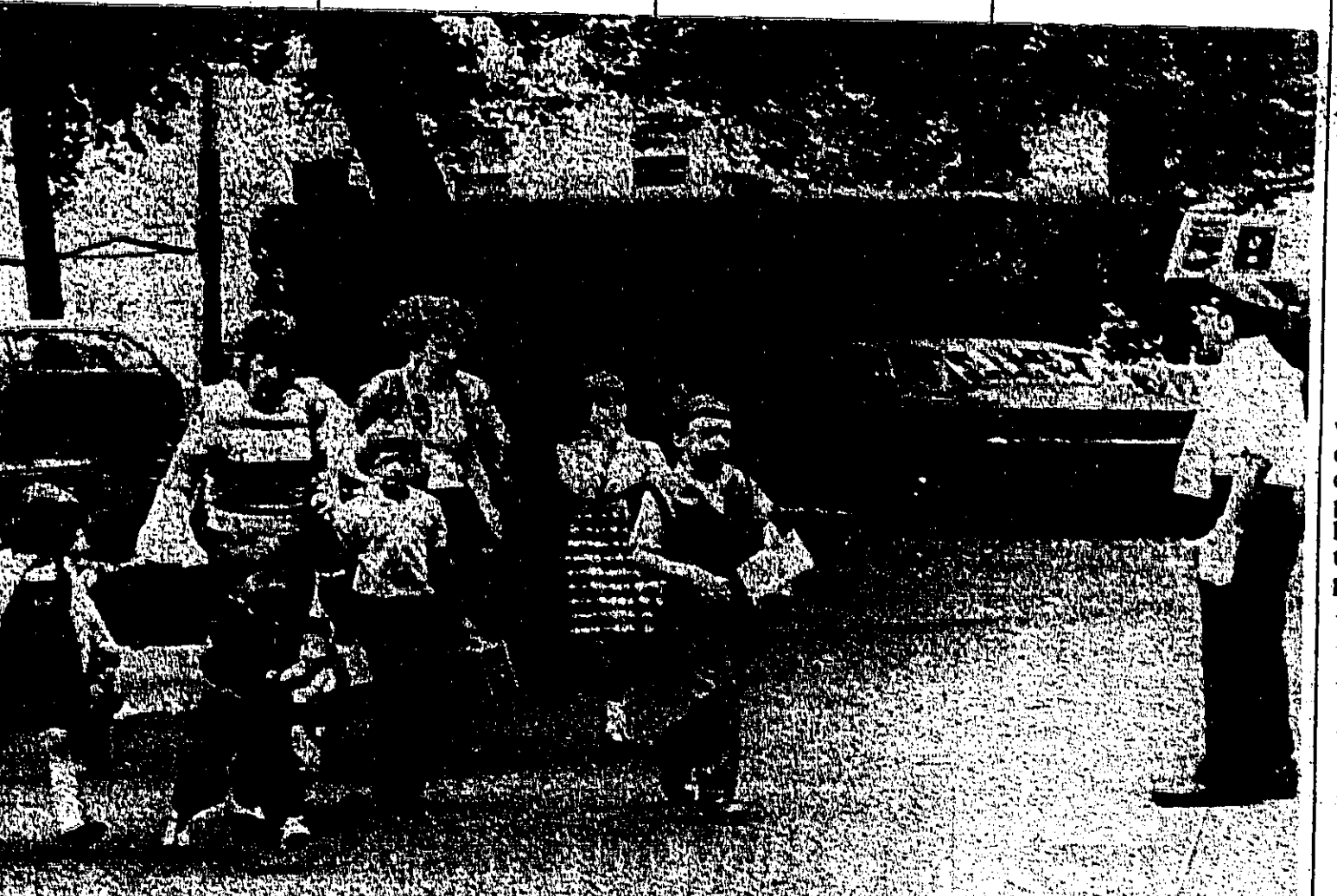
SCHOOL'S OPEN, DRIVE CAREFULLY - Area youngsters and their parents are watched over by a crossing guard during the first week of school earlier this month.

THERE WILL BE ABSOLUTELY NO EXCEPTIONS TO THIS DEADLINE, except in the case of an election cancellation, in which case the editor will have complete discretion as to which deadline to impose and his usual discretion as to the material to be used.