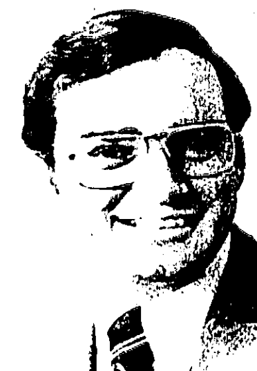
Donald T. DiFrancesco

Sen. Foran is the ranking Republican on the Legisla-