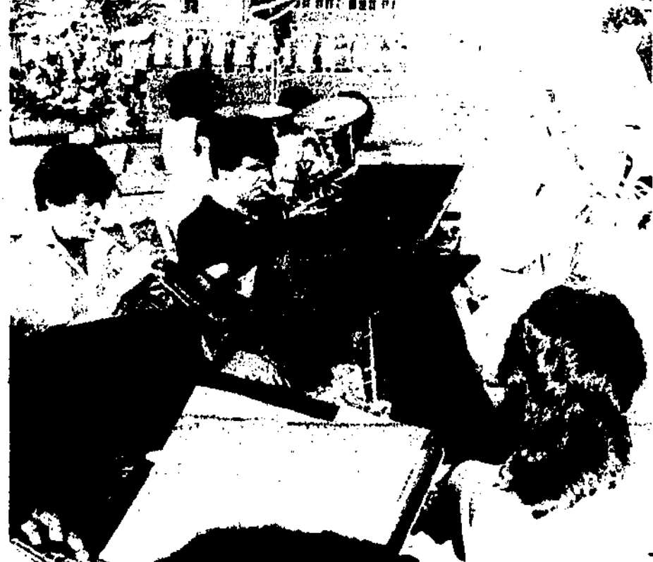
HERALDING THE GRADUATES - The members of the Arthur L. Johnson Regional High School Band of Clark play during graduation ceremonies on June 23.

--Awarded a $13,222 contract to American Tennis and Track, Inc. for tennis court re-surfacing at Johnson.