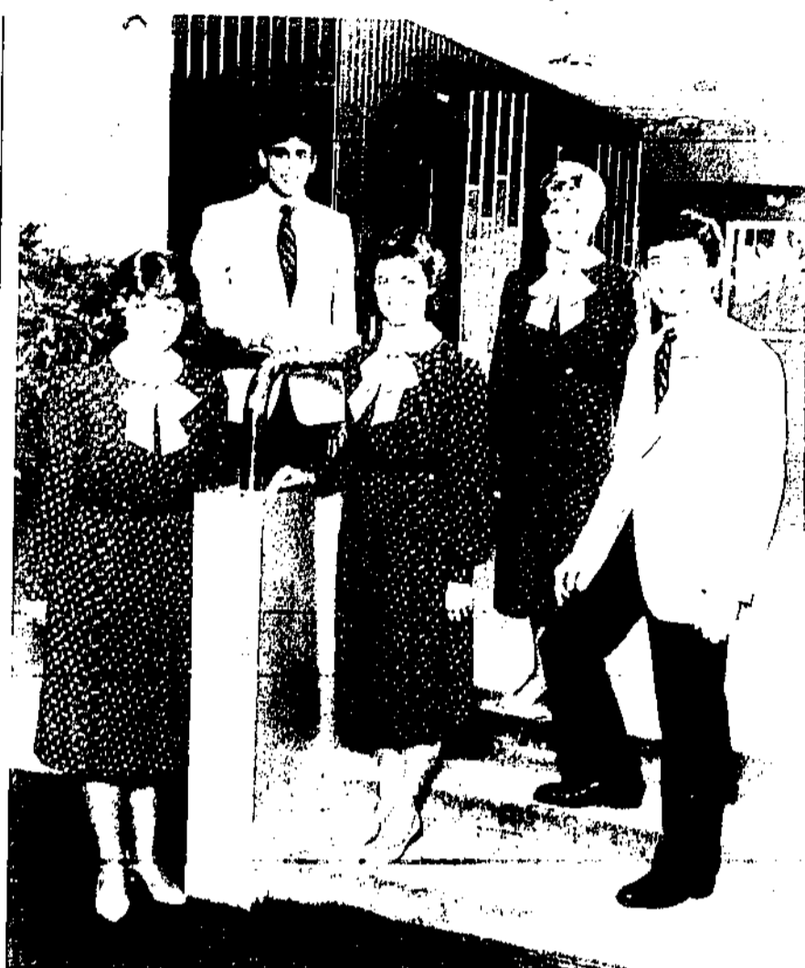
SPREADING JOY... The Joy quartet will sing at the Union County Baptist Church on Thursday, May 29 at 7 p.m.