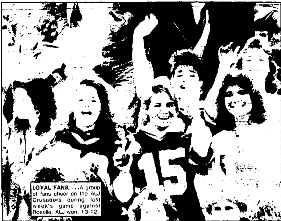
LOYAL FANS... A group of fans cheer on the ALJ Crusaders during last week's game against Roselle. ALJ won, 13-12.