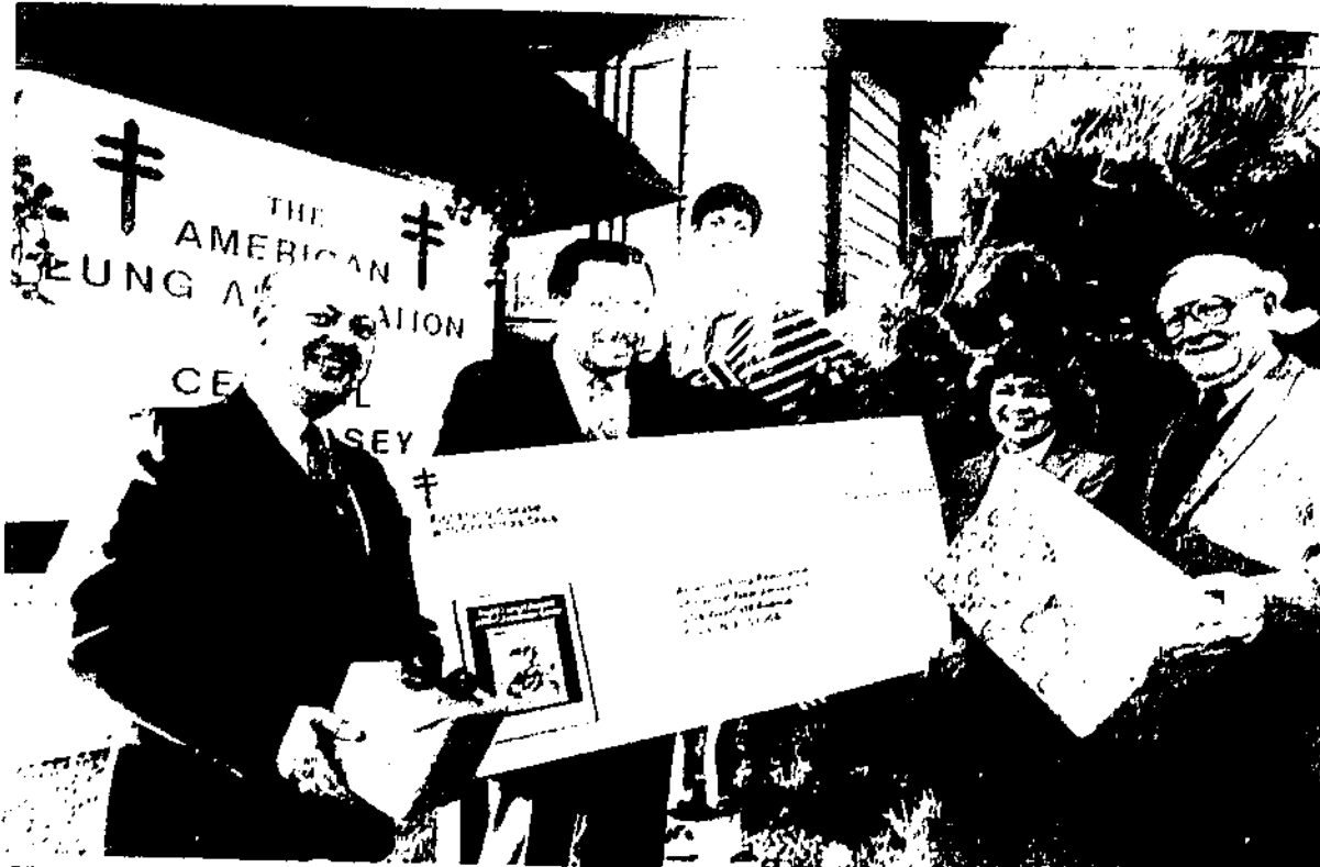
SEAL IT AND SEND IT...Union County board members of the American Lung Association of Central New Jersey are encouraging area residents to send in their Christmas Seal contributions. December 1 was designated "Seal It and Send It Day." Pictured from left