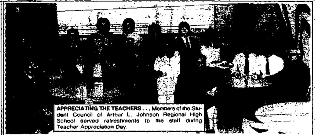
APPRECIATING THE TEACHERS... Members of the Student Council of Arthur L. Johnson Regional High School served refreshments to the staff during Teacher Appreciation Day.

Mountain Inn, Boscobel Mansion and a winery. Plans are being made for a five-day trip to Nova Scotia June 8 to 12, and a nine-night trip to Hawaii on September 15.