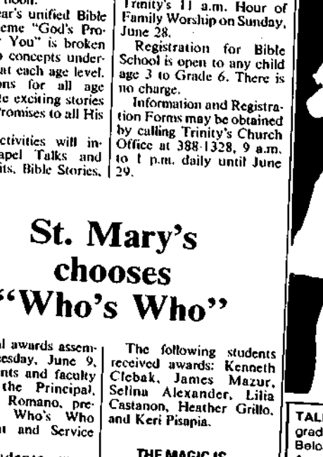
Trinity United Methodist Church, corner of E. Milton Ave. and Main Street will hold its annual Daily Vacation Bible School, June 29 through July 3 from 9:30 a.m. until noon.