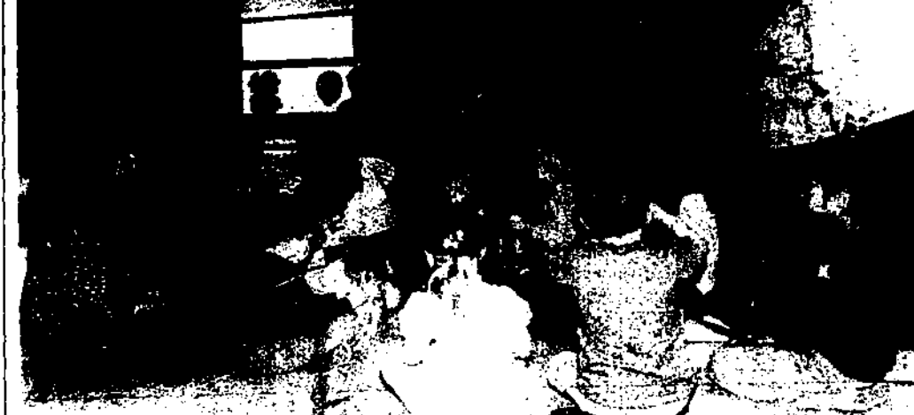
OLDER AMERICAN'S MONTH... The Brother Bonaventure Extended Care Center of Alexian Brothers Hospital was recently decorated with balloons and buttons proclaiming "Love is Ageless" as activities were held in honor of Older American's Month. Activities planned by residents of the Center included a day with the "Gram-

science, which lead to an Associate in Arts degree. Courses in these programs parallel freshman and sophomore offerings at four-year colleges and universities and graduates are eligible to transfer to these institutions with advanced standing. About 80 percent of the graduates of these programs transfer with junior year standing to 500 colleges and universities in all 50 states. The College also conducts cooperative programs in professional nursing and radiography with Elizabeth General Medical Center, Elizabeth and Muhlenberg Regional Medical Center, Plainfield, which lead to an Associate in Science degree conferred by the College and a diploma awarded by the Schools of Nursing and Radiography. Rahway and Clark residents named to the President's List include: