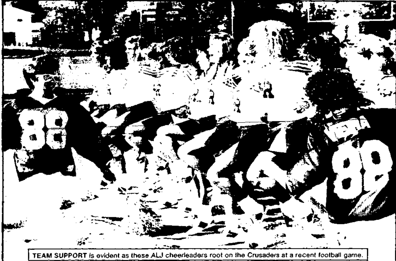
TEAM SUPPORT is evident as these ALJ cheerleaders root on the Crusaders at a recent football game.