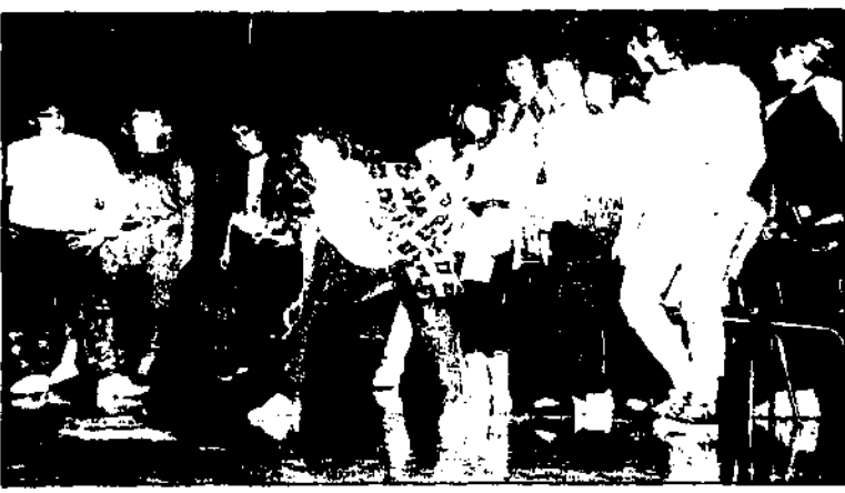
THE FEATURED ACTRESS in ALJ's full production "Voices from the High School,