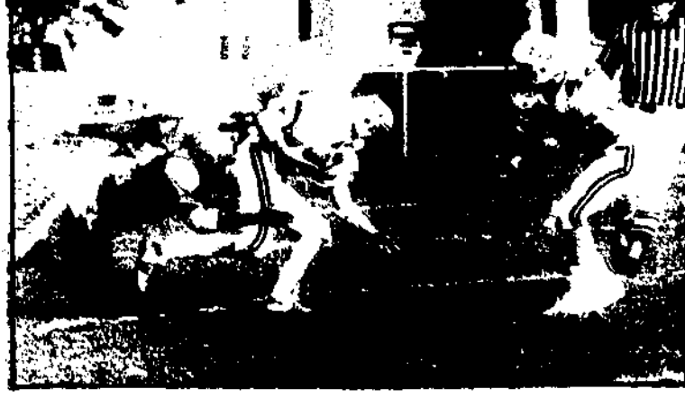
THE ALJ CRUSADERS have reached the playoffs and will play Hackettstown on Satur day, 1 p.m., at Nolan Field, ALJ is 7-1 while Hackettstown is 8-0

the 2nd Armored Division, Fort Bood, Texas.