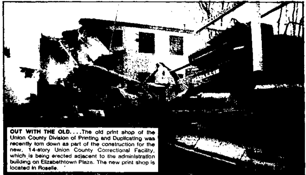
OUT WITH THE OLD. The old print shop of the Union County Division of Printing and Duplicating was recently torn down as part of the construction for the new, 14-story Union County Correctional Facility, which is being erected adjacent to the administration building on Elizabethtown Plaza. The new print shop is located in Roselle.