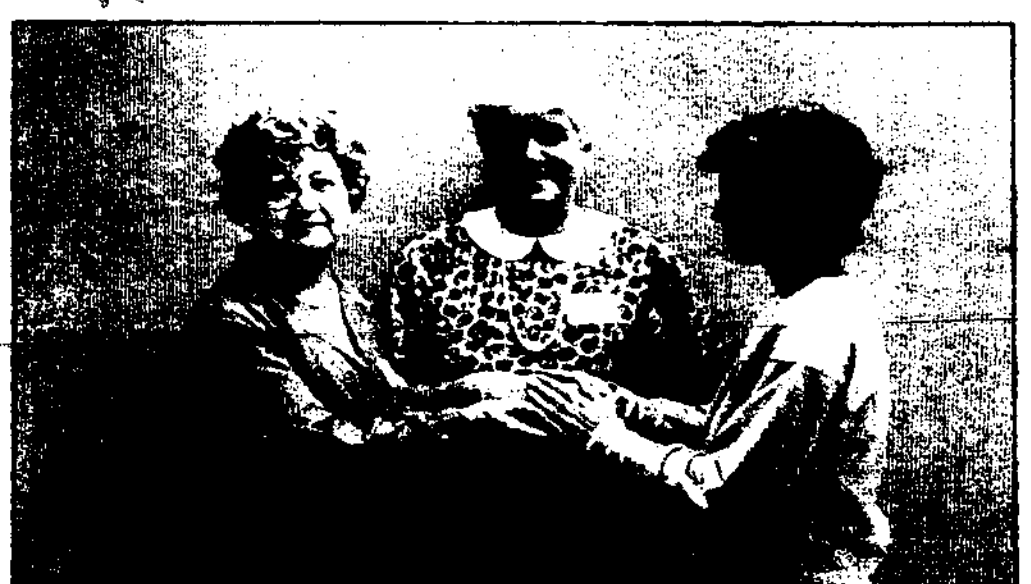
HOSPICE STAFF HONORED ... During November. National Hospice Month, the Rahway Hospital Hospice held a recognition dinner honoring its staff of over 30