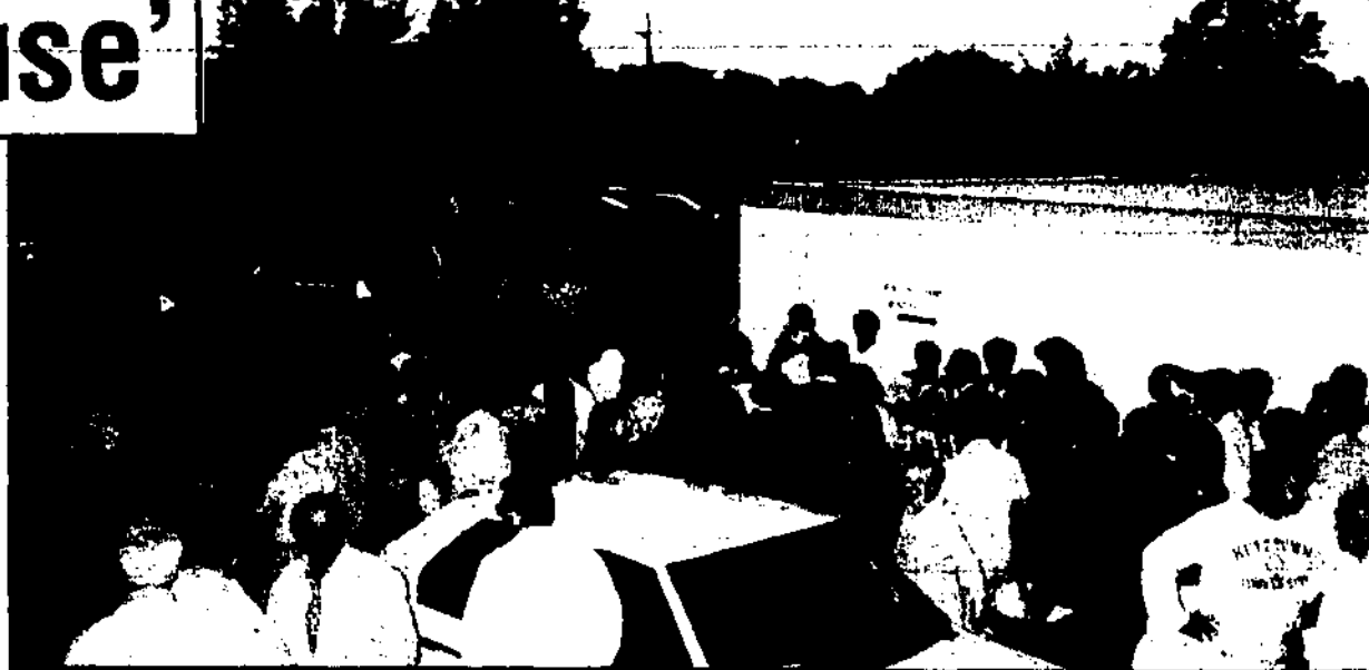
CONCERNED CITIZENS ... Clark residents disperse special meeting on garbage collection due to over

through their property taxes | Last night's meeting which would make the brought out crowds to Brewer School for the rescheduled meeting. Events