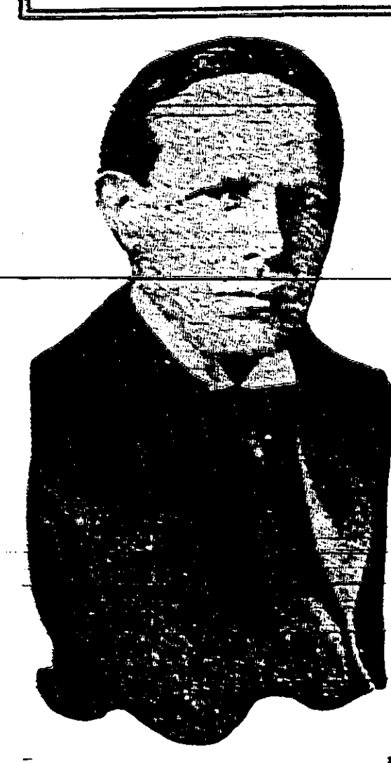
NOTE TO FRIENDLY NATIONS.

In Charge of the Indianapolis Grand Jury in Dynamic Probe.