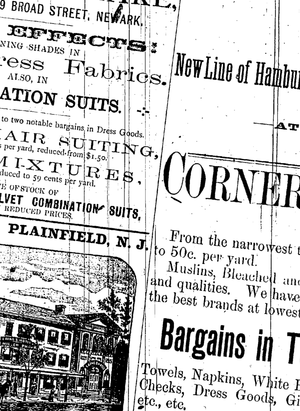
Laing's Hotel, Plainfield, N.J.

Attention is especially invited to two notable bargains in Dress Goods.