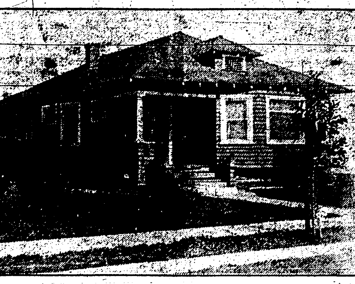
PERSPECTIVE VIEW FROM A PHOTOGRAPH