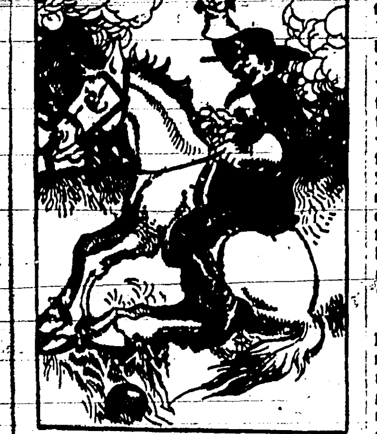
THE MOUNT HAD A BITTING HABIT.