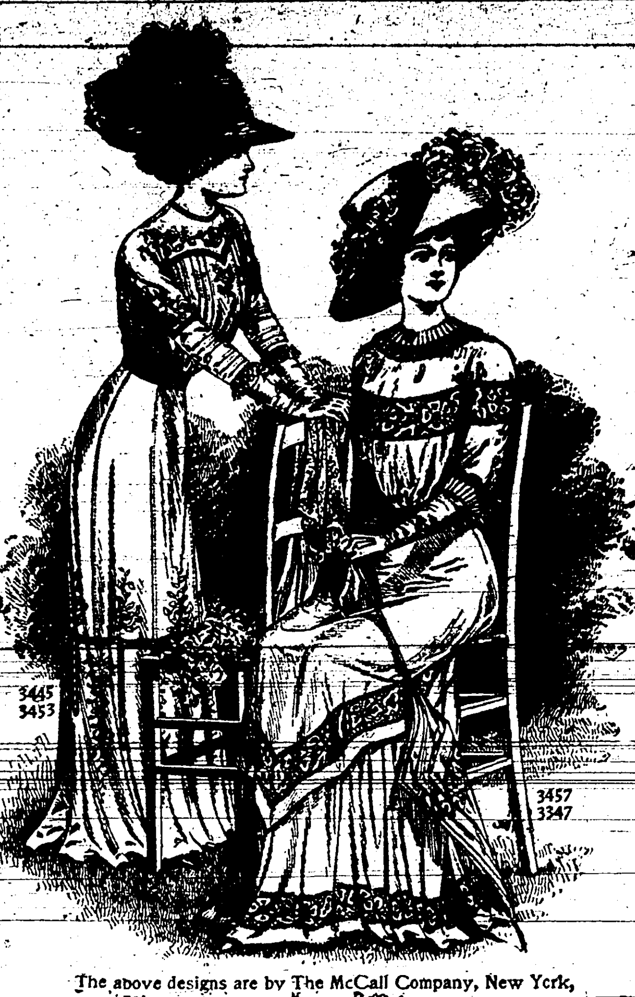
THE LIFE OF THE SUMMER GIRL.

Northfield is to hear a great many famous Englishmen at its six conferences this summer. The founder, Dr. L. Moody, was a well known Englishman in America.