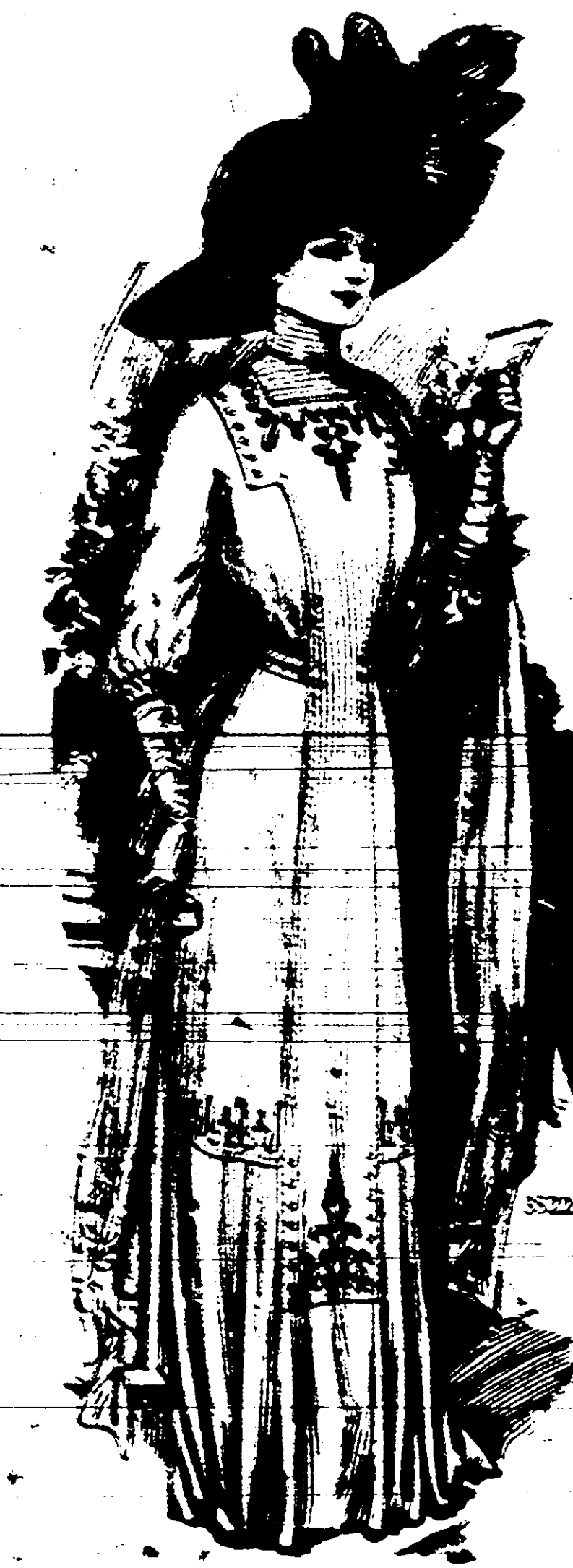
The above design is by The McCall Company.

Revel Frills That Offer Valuable Suggestions—Black Accessories for Development and Style.