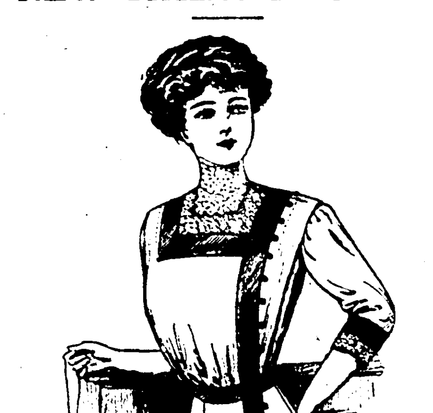
The above design is by the McCall Co.

Cloths and Heather Mixtures: Frog Fastings on Coats; New Motor Coats; Silk Hats and Nette Dress Trimmings.