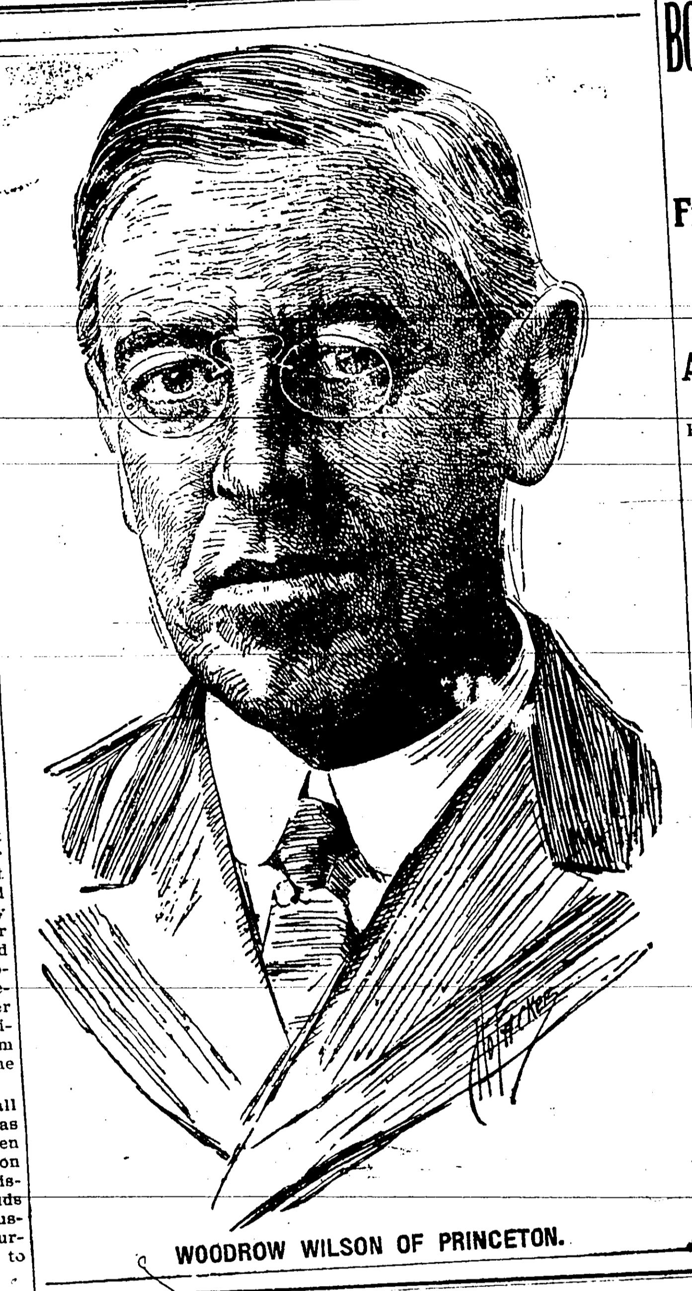
WOODROW WILSON OF PRINCETON.

Princeton President Wants Loyal Support Of All Honest Men Who Stand For Purity In This State's Government. Mr. Wilson's speech in full was as follows: “You do me great honor by giving me so great and generous a reception and I thank you for it to the bottom of my heart.”