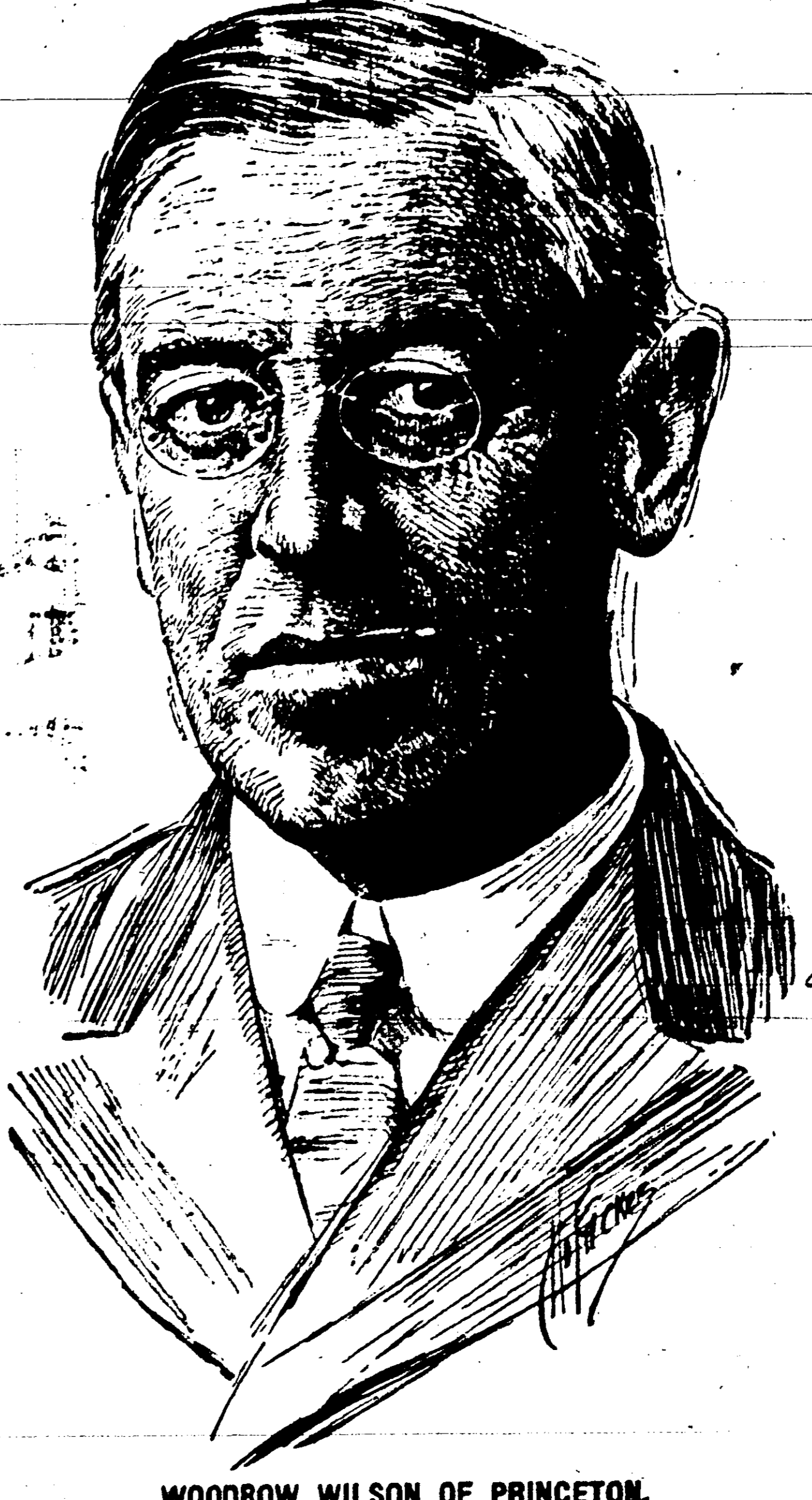
WOODROW WILSON OF PRINCETON.