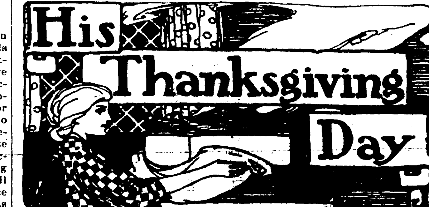
His Thanksgiving Day

A very warm session of Common Council is promised for tonight. It is said that the Armstrong-Wright-Trembly Engine Co. No. 2 crowd are out for blood—that they will not acknowledge defeat and that they propose to have a La France engine or nothing.