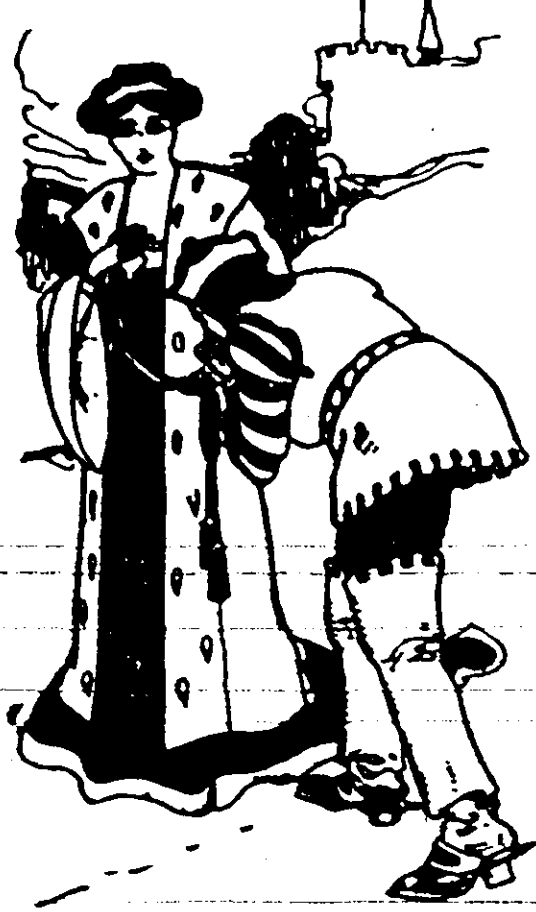
THE KNIGHT WHO RAN AWAY FROM HIS MISTRESS.