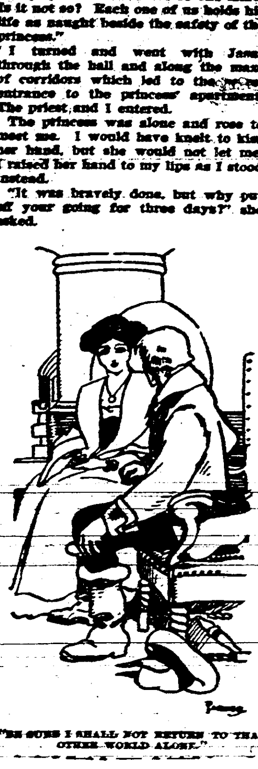
HE WAS A KNIGHT OF THE SILVER STAR

SYNOPSIS. Oleto Verrall, a traveler, hears from a newspaper of a mysterious country beyond the Caucasus range. They are carried there by a steamer, which is the "Mystic," and Verrall is met at the pier by a woman, who is the princess of Drumcald, who is the daughter of the King of Drumcald. Verrall is taken to the palace, where he meets the princess, who is the daughter of the King of Drumcald. Verrall is taken to the palace, where he meets the princess, who is the daughter of the King of Drumcald. Verrall is taken to the palace, where he meets the princess, who is the daughter of the King of Drumcald.