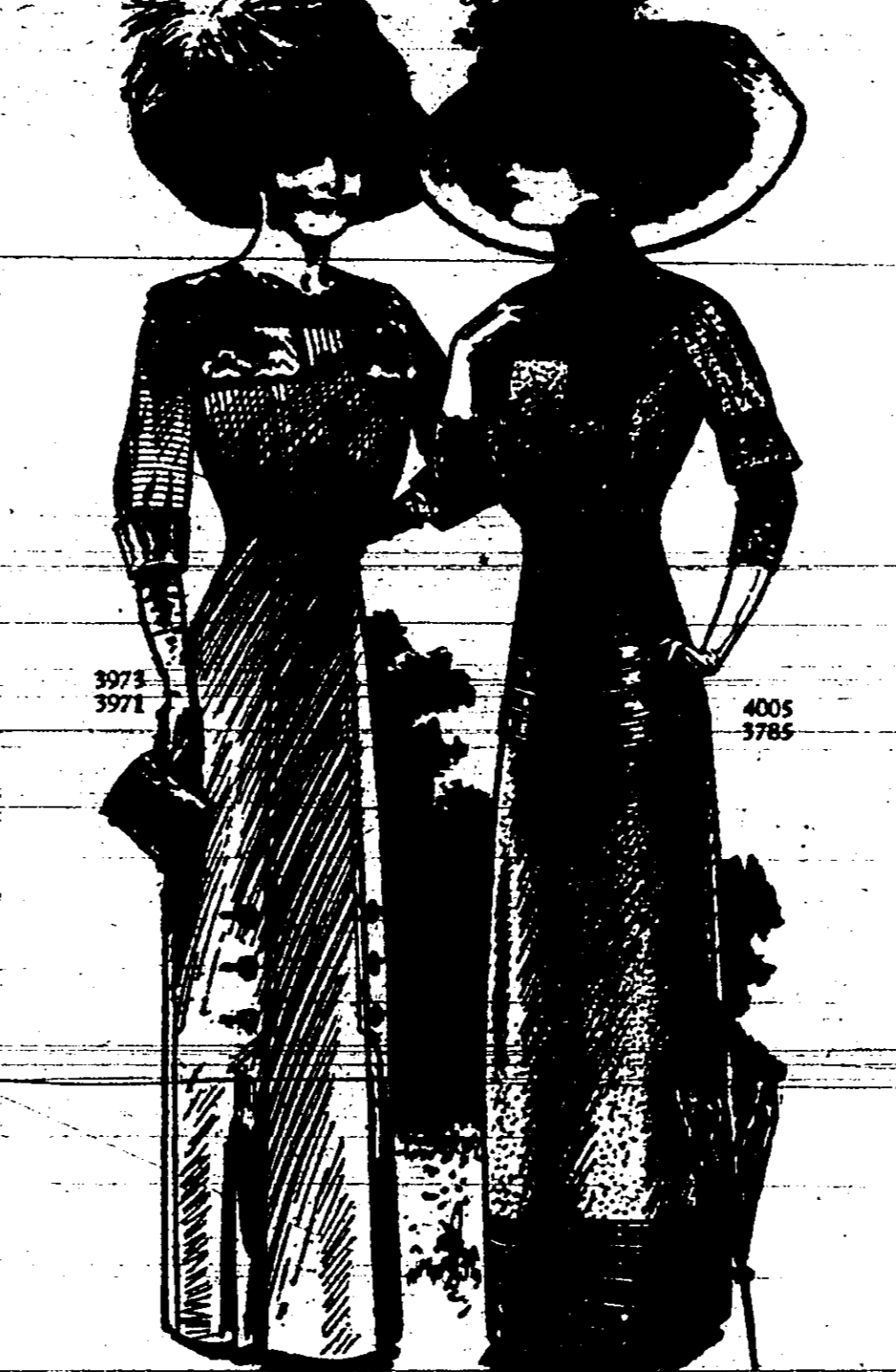
The above designs are by The M-C Company, New York.

WANT DANCING PARTNER AT CHARLEY VAUDEVILLE'S-GIRLS GROUPS IN FASHIONABLE TIA-TOES-ALL SORTS