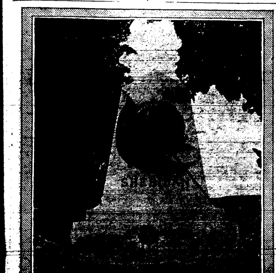
GENERAL SHERIDAN'S MONUMENT IN ARLINGTON.