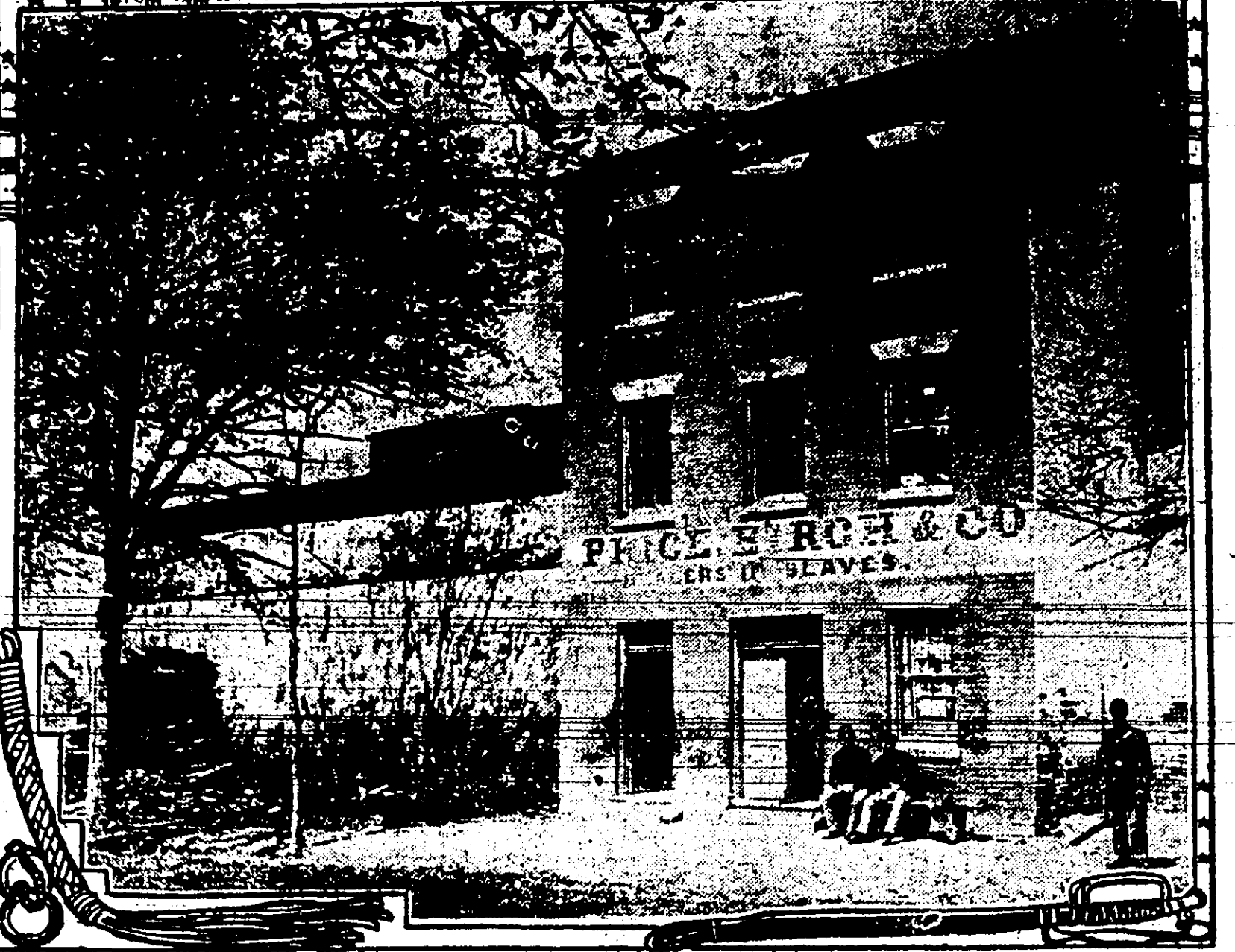
READ the sign painted on the front of the building in the illustration, which is from a wartime photograph...