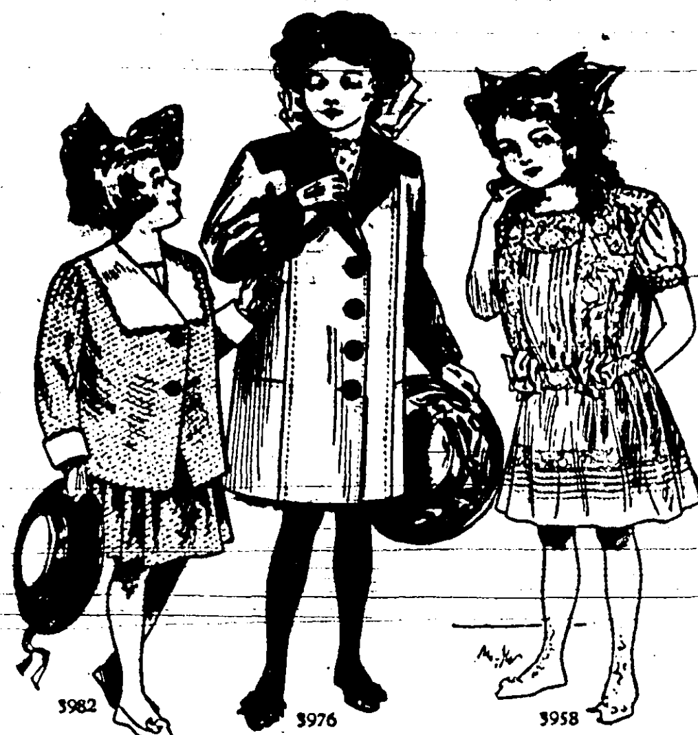
The dress designs are by The McCall Company, New York.

COLORS THAT RIVAL A DUTCH TULIP RED—PRETTY FACES UNDER ODD HATS—GIRLISH FRENCH OF PICTURESQUE STYLE—LINGERIE COLLARS AND FIXINGS