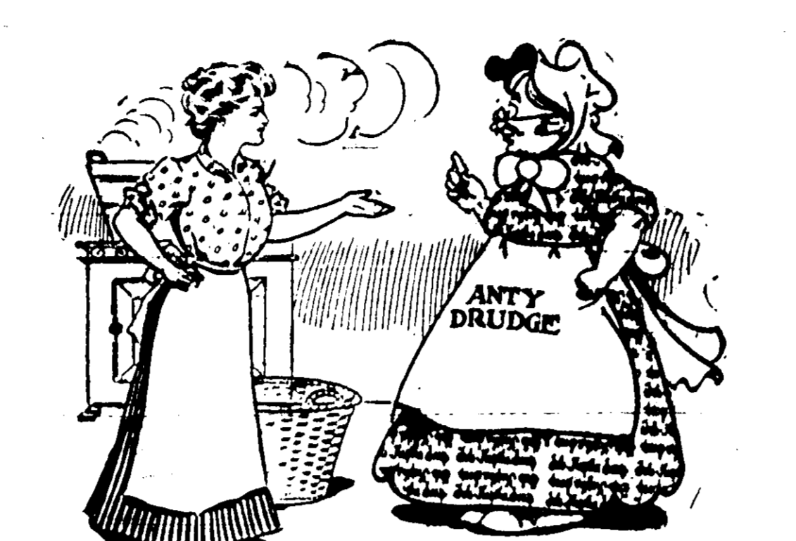
Anty Drudge posts Mrs. Youngbride.

May we have a trial for you next week? Rahway Steam Laundry 61-63-65 Campbell Street, Telephone 208