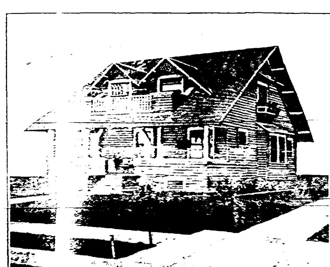
RESPECTIVE VIEW—FROM A PHOTOGRAPH