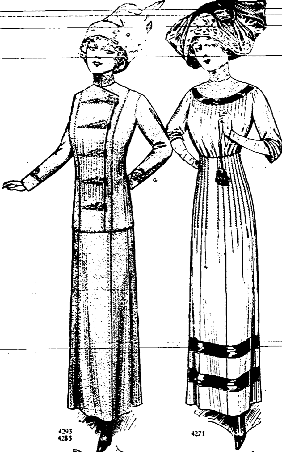
The above designs are by The McCall Company, New York.