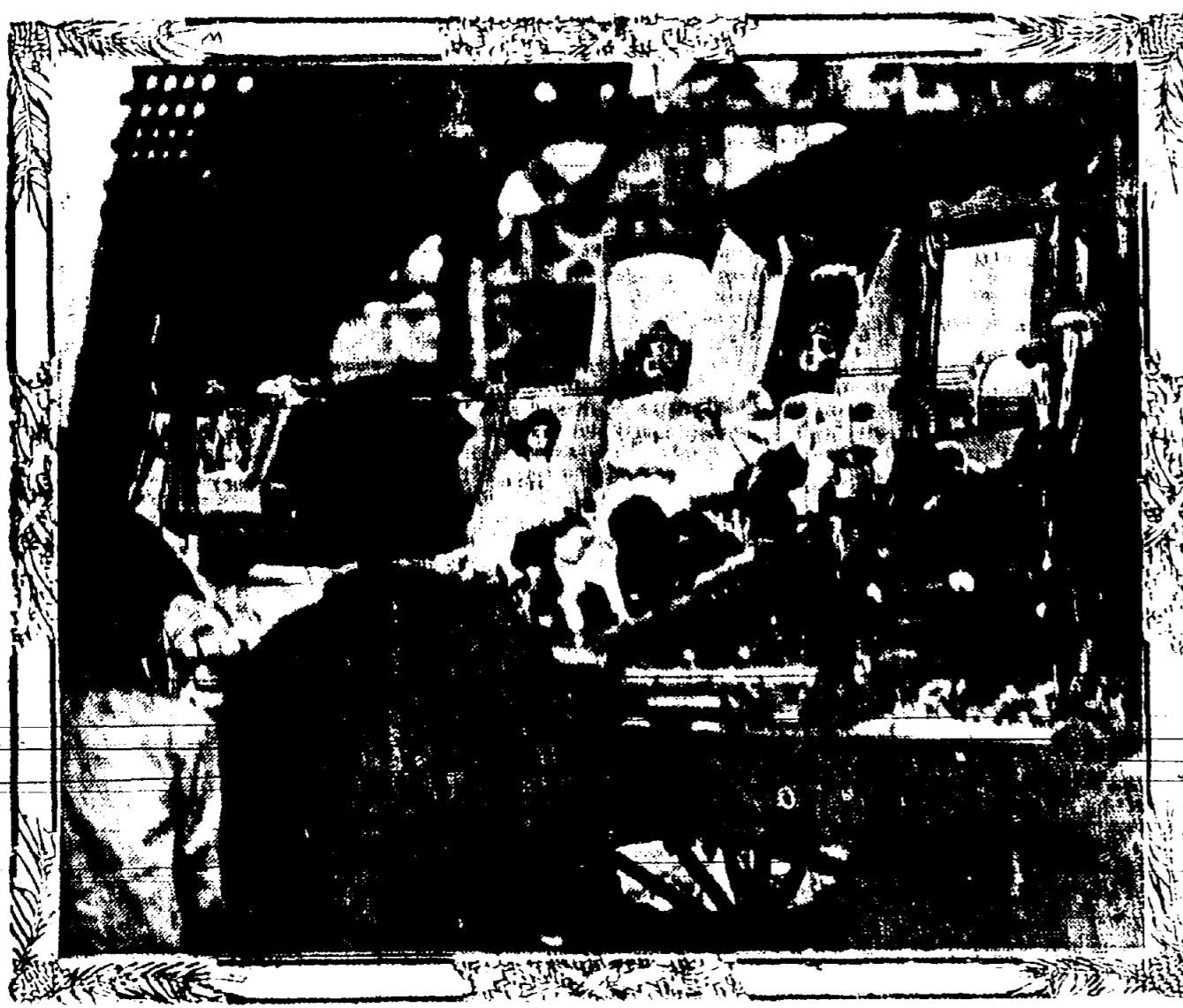
A Christmas Lesson. A group of children are gathered around a piano, participating in a lesson. The room is decorated for the season.