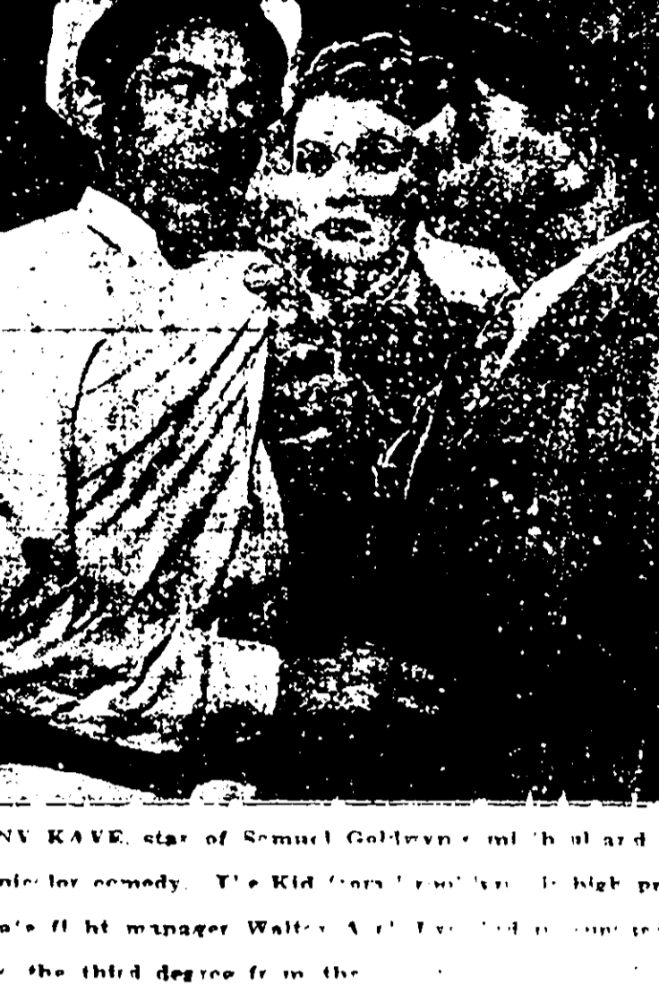
from the BKO Padlockbox