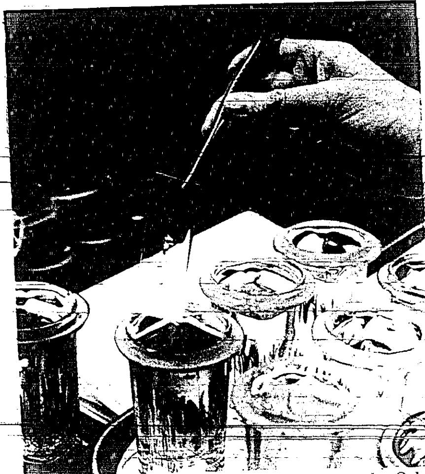
THE CLOSE LOOK ... Cancer research is costly. Only contributions will make possible advancements in finding drugs and treatments which abuse and cure the deadly disease.