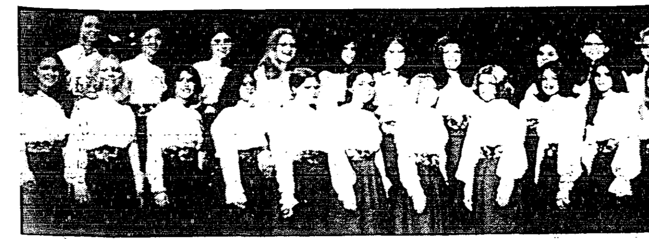
The Belle Tones of Arthur L. Johnson Regional High School will be featured in Benjamin Britten's "Ceremony of Carols"...