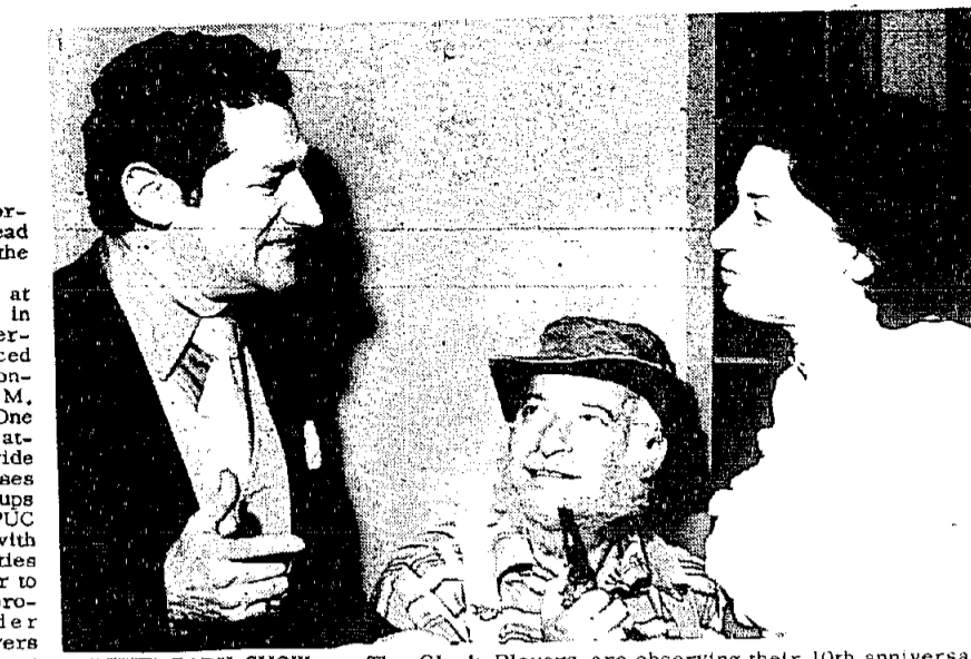
Members of the Clark Players are observing their 10th anniversary by staging an original production...