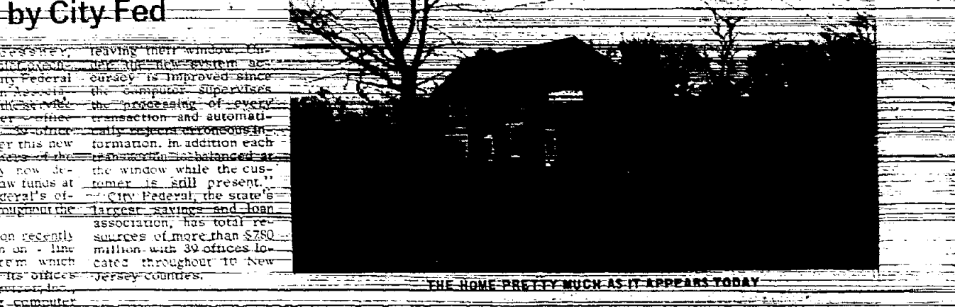
THE HOME PRETTY MUCH AS IT APPEARS TODAY