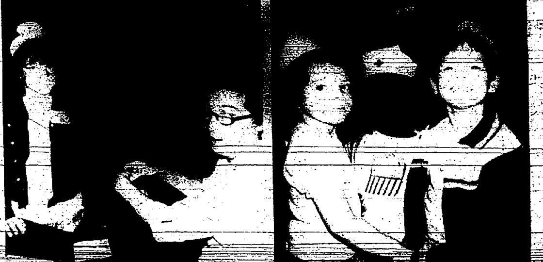
Sixty-nine girls advanced in the scout program at a bridging ceremony of the Clark-Windfield Association of the Delaware-Karlan Girl Scout Council in June 12 at Carl H. Miller School of Clark.