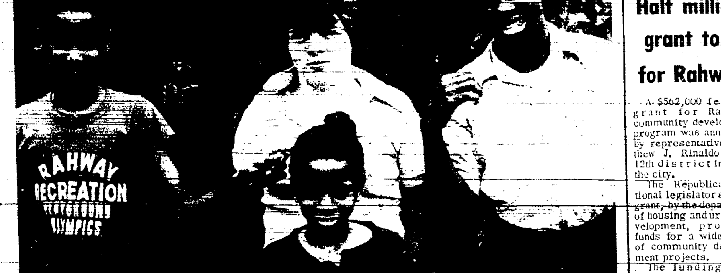
RAHWAY RECREATION... The group is discussing the recreation program...