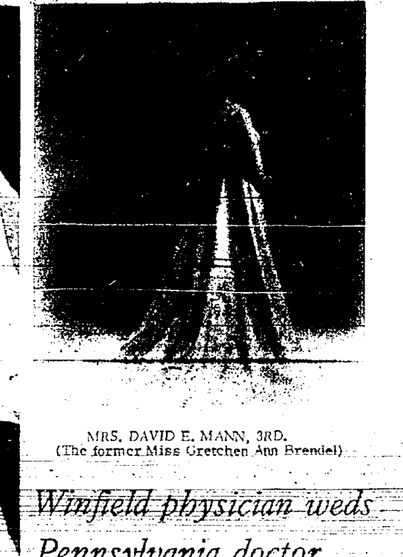
Winfield physician weds Pennsylvania doctor