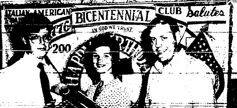
MAJAN AMERICAN BICENTENNIAL CLUB... The club is holding a meeting tonight...