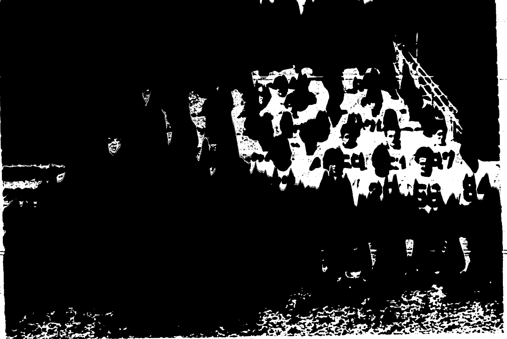
Members of the 1980 Railway High School Football Team are shown as they prepare for the Thanksgiving Day game.

Members of the 1980 Railway High School Football Team are shown as they prepare for the Thanksgiving Day game. The team is looking forward to a challenging game against the Clark Patriots on Thanksgiving Day.