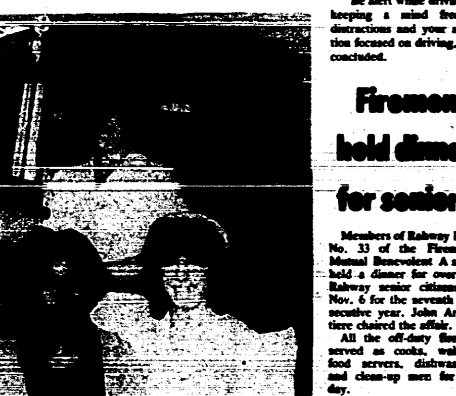
Firemen hold dinner for seniors... Members of Rahway Local No. 21 of the Firemen's Association held a dinner for over 100 members...