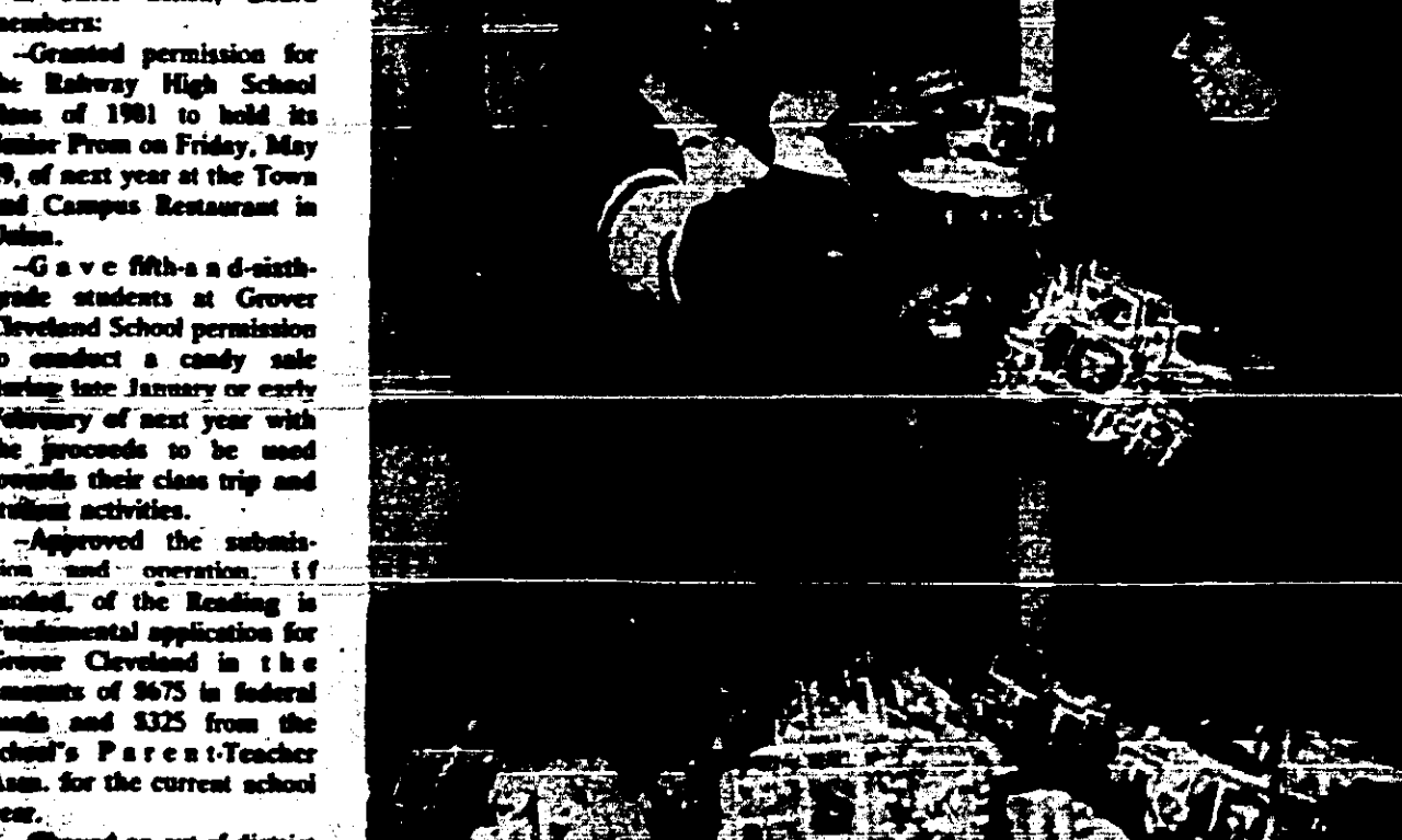
STUDYING — Pupils of the Union County Dept. of Human Resources, Division of Youth Services, are shown studying Christmas presents that were donated by AYVRA, an organization of parents and corrective officers...