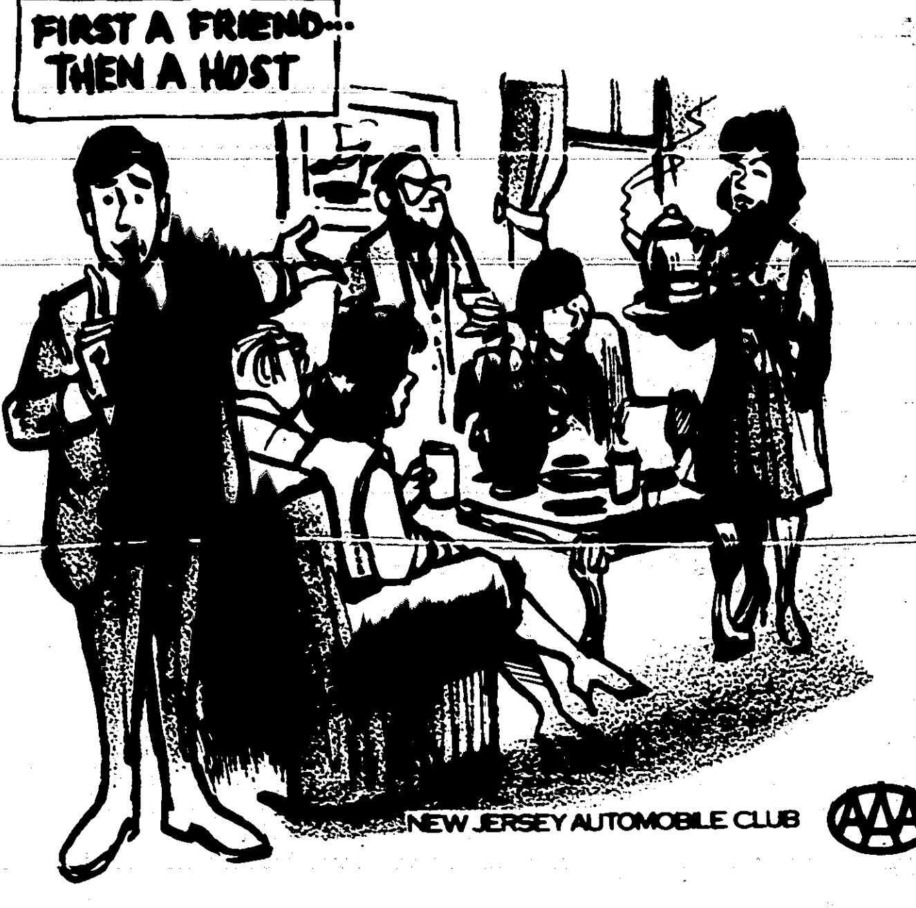
NEW JERSEY AUTOMOBILE CLUB

Widener was arrested in a theft in the city. The theft was a very serious crime. It was a crime that was very serious. It was a crime that was very serious. It was a crime that was very serious. It was a crime that was very serious.