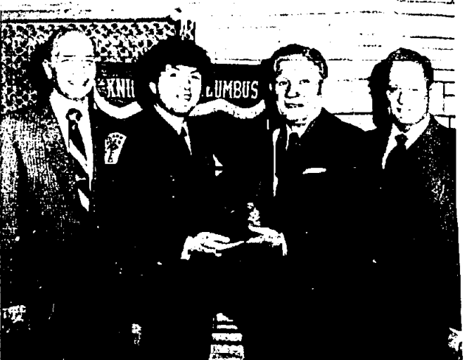
BURGLARY BUNGLER: Clark Patriot Editor, second from left, was awarded the Knights of Columbus Award in the Bronx, N.Y. by the Knights of Columbus. He was presented to the club by the Knights of Columbus. He was also a member of the organization for about ten years and has been operating in various capacities in the area of burglary and robbery arrests. The photo is being presented by the Knights of Columbus. Second from right, is Clark Patriot Editor, Editor and Editor. Right is Editor and Editor.

The chairman and chief executive officer of General Electric Co., Reginald H. Jones, was nominated to the Board of Directors of Merck & Co., Inc., of Rahway, N.J.