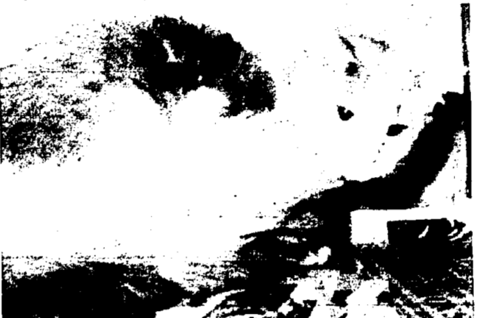
PURRFECT PET - Walter, a male, orange and white Persian cat, a one of many pets awaiting adoption at a known kennel, operated by the Union County Society for the Prevention of Cruelty to Animals at 90 St. George Ave., Rahway. His number is 3181.