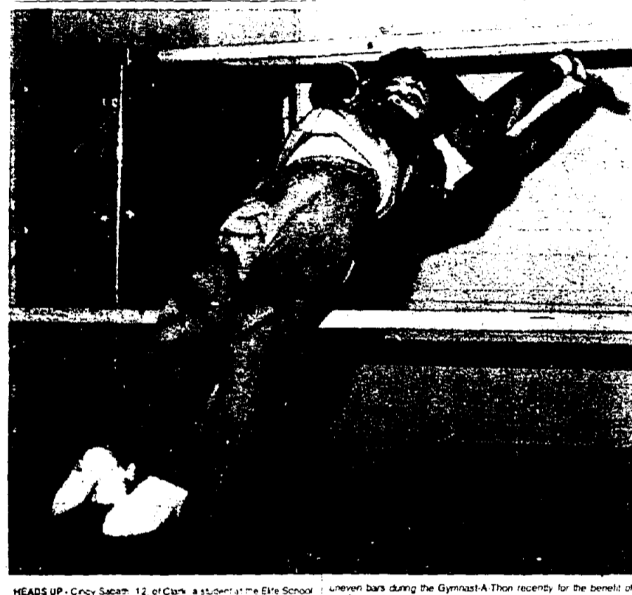
HEADS UP. Clark swimmer... (text partially obscured)