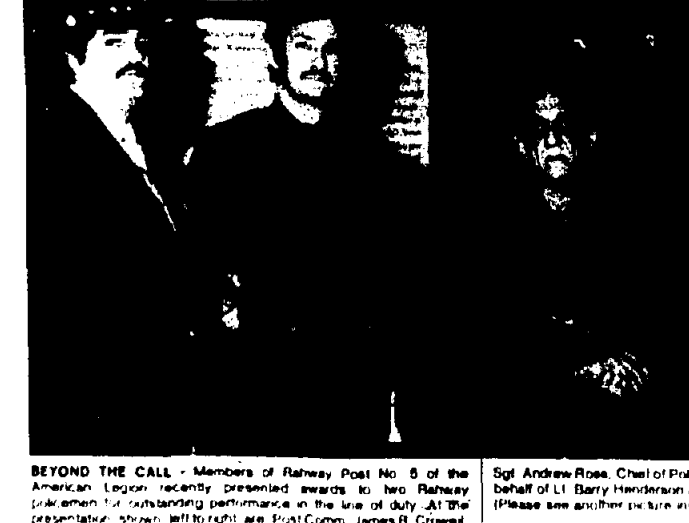
BEYOND THE CALL - Members of Rahway Post No. 8 of the American Legion, recently presented awards to two Rahway children for outstanding performance in the state of New Jersey. (Please see story on page 10)