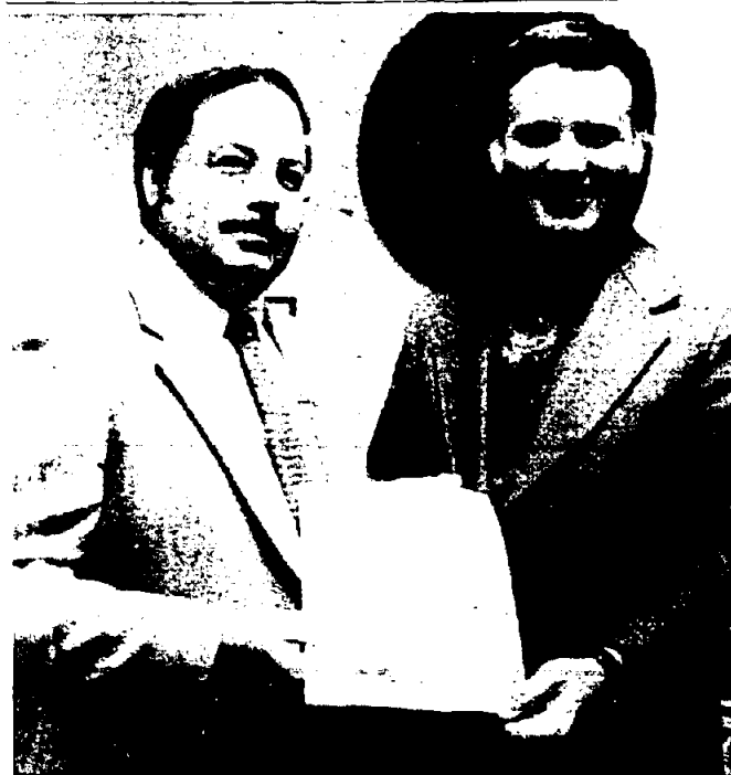
HAPPY BIRTHDAY... In recognition of the Newark-Lions Club 30 years of service in providing eye glasses to the needy...