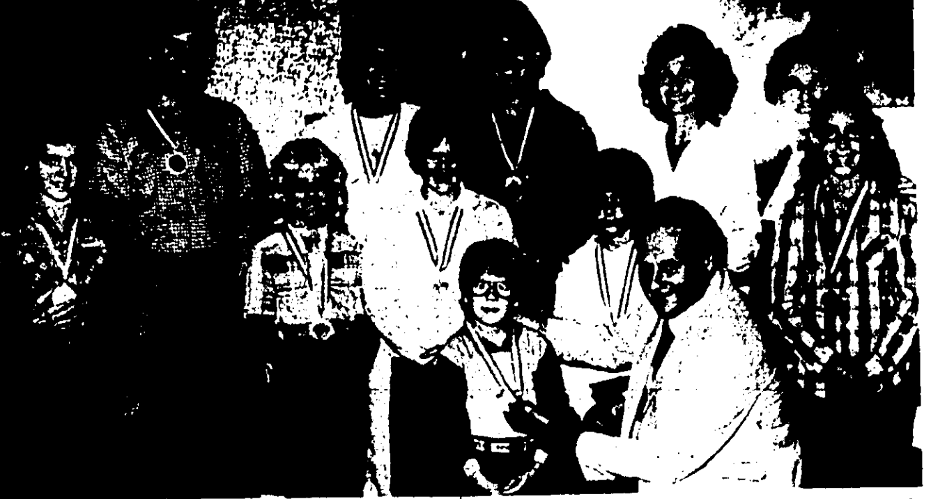
RAHWAY, SUMMIT in 'rematch' game

The first football game between the Rahway and Summit Hills players was played on Saturday, Oct. 17, at 1:30 p.m. This was a repeat of last year's North Jersey Section No. 2 Group No. 3 championship matchup, which the Indians lost 10-7 at the Grant Stadium last December.