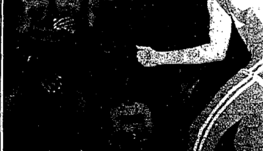
Athletic Assn. Group No. 3 championship at Jadwin Gymnasium in Princeton on Feb. 25.