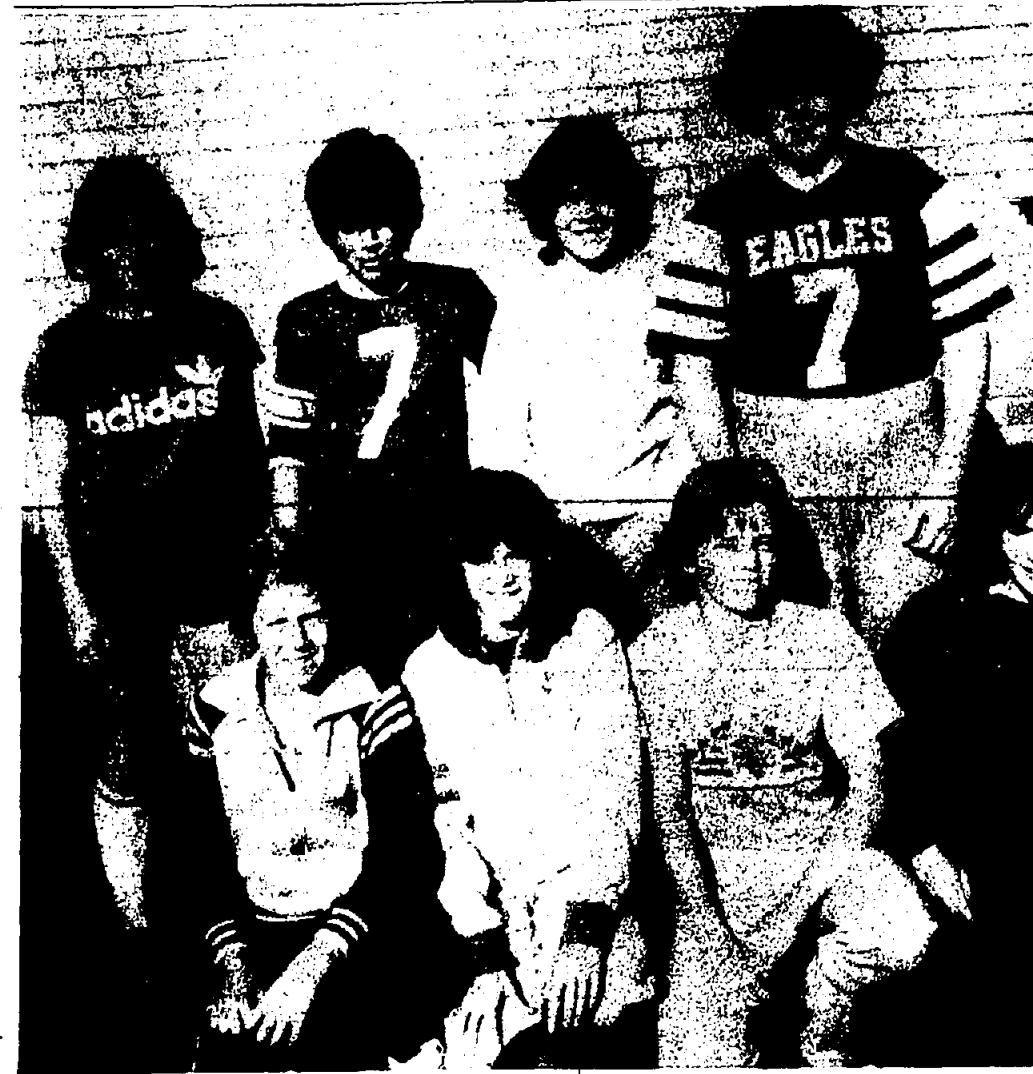
WENT ON GEORGIO - The Cosmos, a group of seventh-and-eighth-grade students in Clark's Charles H. Brewer School, won the Annual Physical Education Class Soccer Championship by scoring a total of 189 points. The championship was awarded on points rather than on goals.